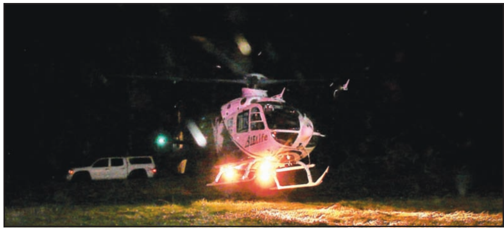
Air Life Georgia life-flighted the lone survivor of the Dec. 19 plane crash off Kings Road near the Blairsville Municipal Airport.

The NTSB investigator will also be looking to establish a history of the flight, including "where they were going, when they were going, where were they coming from, etc.," according to Weiss.