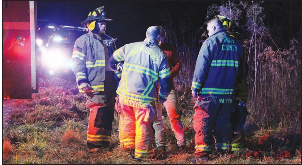
Union County firefighters near the scene of the Kings Road plane crash.