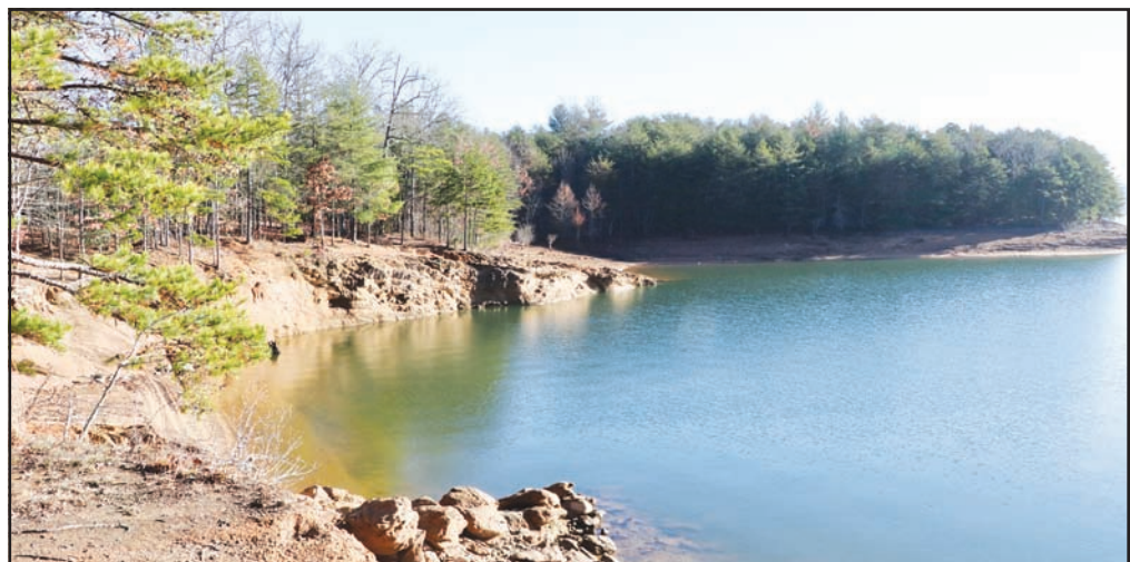
The Cliffs at Lake Nottely.